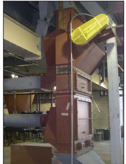
Crown Closed Loop Aspiration System.